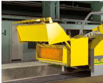
brush for bed